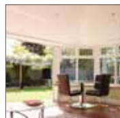
No tie bar required

Ultraroof creates a beautiful vaulted ceiling and no tie bar is required